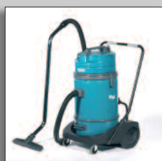
V14 large capacity with trolley