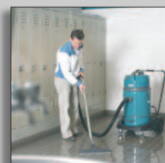
Machine in action