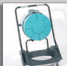
Easy tilting tank