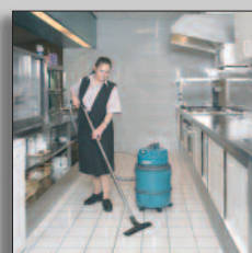
Machine in action